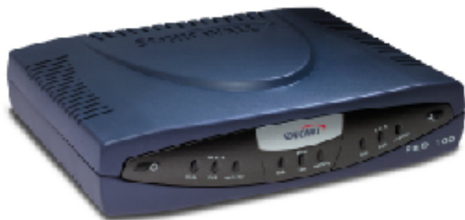
SonicWALL PRO 100

The SonicWALL PRO 100 Internet security appliance meets the demands of growing businesses and adapts to network security threats, protecting an organization's valuable data. With SonicWALL's security ASIC, the PRO 100 delivers maximum multi-user firewall and VPN performance.